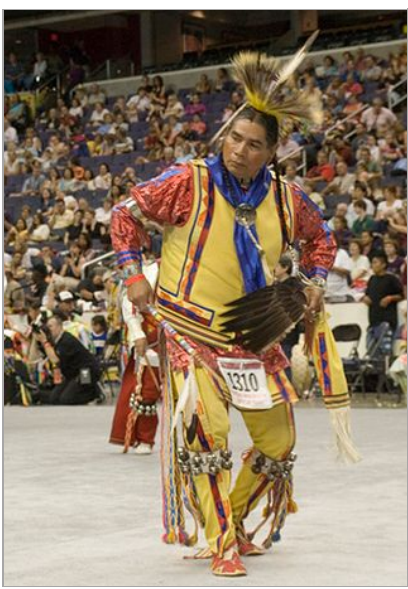
National Powwow 2005, USA, National Museum of the American Indian 2005, Foto: R.A. Whiteside / Flickr (Public Domain)