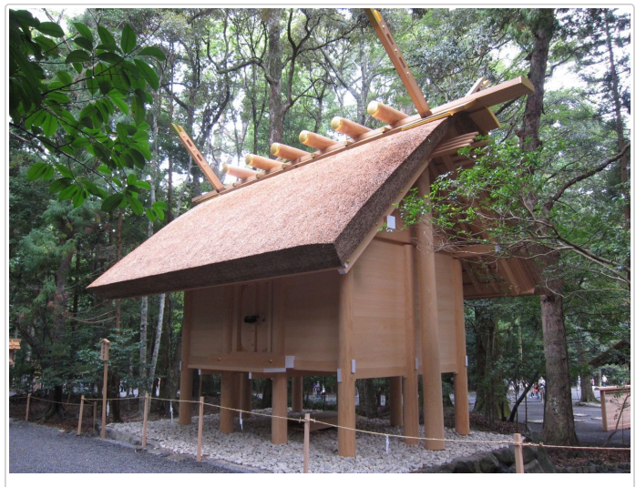
The Inner Shrine of Ise Grand Shrine (Naiku).

The safeguarding of historical authenticity became a prominent concept in international historic preservation in the last third of the twentieth century, beginning with the Venice Charter in 1964. [57] So-called tests of authenticity were established as a