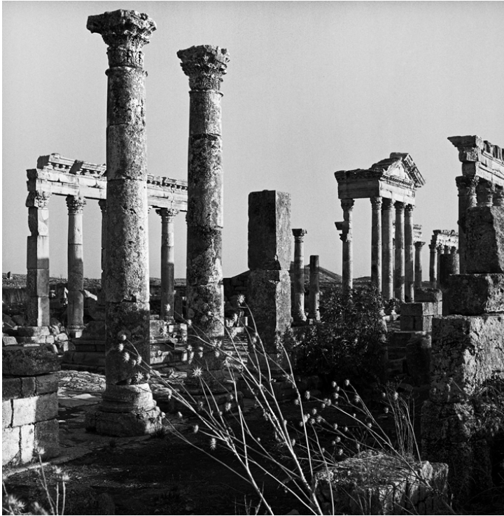
Apamea, 2003.