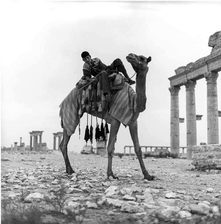
Palmyra, 2003.

Just before dusk the bright, late afternoon sun shone on the fine stonework of the grand gate of Resafa, slicing the large columns like a knife with a stripe of sunlight that appeared to split them to half their width. (Kevin Bubriski, p. 162)