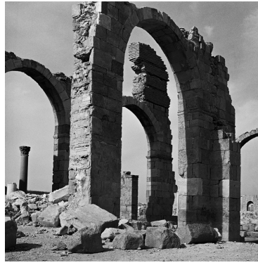
Mosque of the larger enclosure at Quasr Al-Hayr Al-Sharqi, 2003.

Just before dusk the bright, late afternoon sun shone on the fine stonework of the grand gate of Resafa, slicing the large columns like a knife with a stripe of sunlight that appeared to split them to half their width.