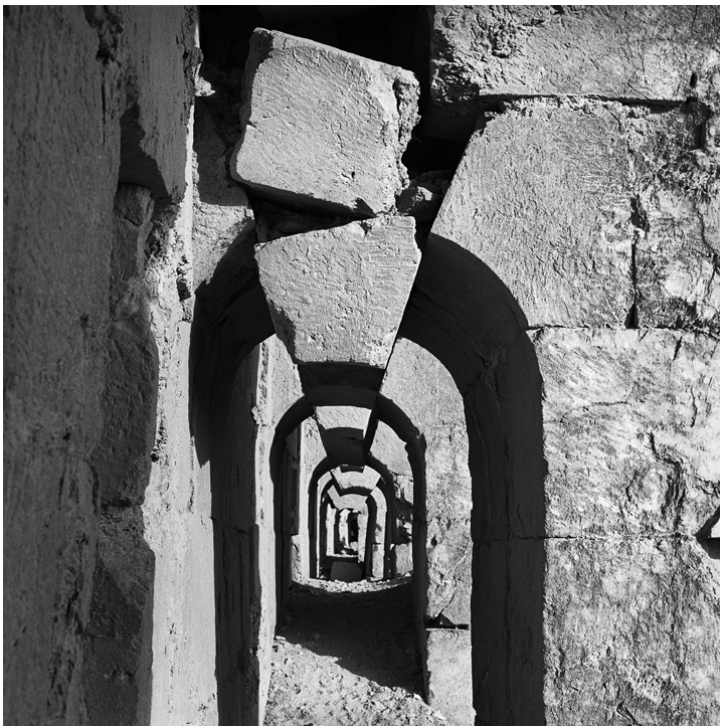
Gallery of the city walls in Resafe, 2003. From "Legacy in Stone" by Kevin Bubriski, published by powerHouse Books © with courtesy

The horizon at Apamea was punctuated by the tall, proud, kilometer-long colonnade that demarcated the grand Roman roads of two millennia ago, its variety of Ionic, Doric, and Corinthian columns crowned with austere capitals or richly carved with floral designs. (Kevin Bubriski, p. 161)