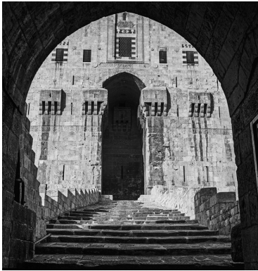
Inner gateway to the Citadel of Aleppo, 2003. From “Legacy in Stone” by Kevin Bubriski, published by powerHouse Books © with courtesy

“Legacy in Stones: Syria before War” begins with a few lines from the late Syrian intellectual Sadik Al-Azm. This is followed by a foreword from his son, Amr, who believes that “cultural heritage derived from a common shared history is critical to re-establishing a Syrian identity that takes no account of ethnic, sectarian or tribal affiliation” (p. 8). According to Amr Al-Azm, this rich history, embodied in material relics across Syria’s landscape and in its museums, can in fact become a vehicle of stabilization and reconciliation. The book is illustrated with maps and rich historical information from Ross Burns.