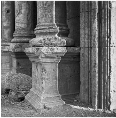
Resafa, North Gate of the city 2003.