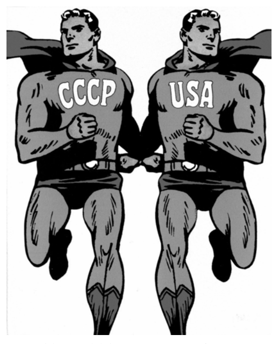
Cover of the French left-wing art magazine 'Opus International', 1968, by the Paris-based Polish artist Roman Cieślewicz.

reviewers and of the wider public were enthusiastic and acclaimed the curators' choices.<sup>2</sup>