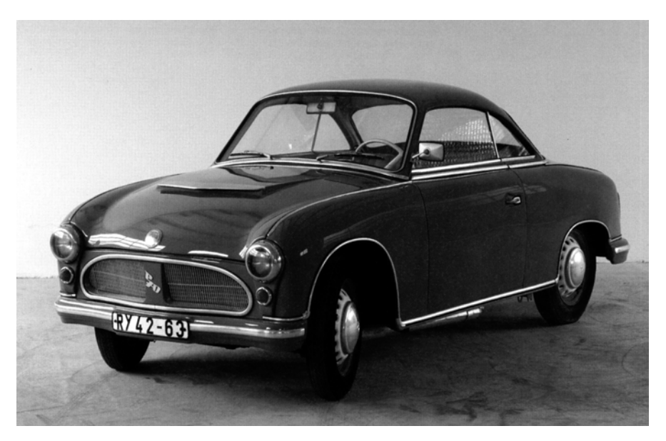
Walter Ende, P70 Coupé, Duroplast (plastic) body. Manufactured by VEB Automobilwerk AWZ, Zwickau, GDR, 1954.

Further afield, one could stop before a black ceramic coffee set designed in the GDR by Hedwig Bollhagen, which never went into production because Walter Ulbricht deemed it 'not joyful enough' (1961), or in front of a decorative glass object with concave surfaces by the Czech artist Václav Cigler (1968– 1970). This part of the display, however, was more reminiscent of a decorative arts museum than of daily life in all its triviality – especially behind the Iron Curtain. Meanwhile, the propaganda films shown at the American National Exhibition in Moscow (1959), which were intended to demonstrate the superiority of the American Way of Life, occupied an entire wall in the following room and loudly produced the same massive and irrepressibly modern effect of consumer society they must have had at the time on disbelieving Muscovites.