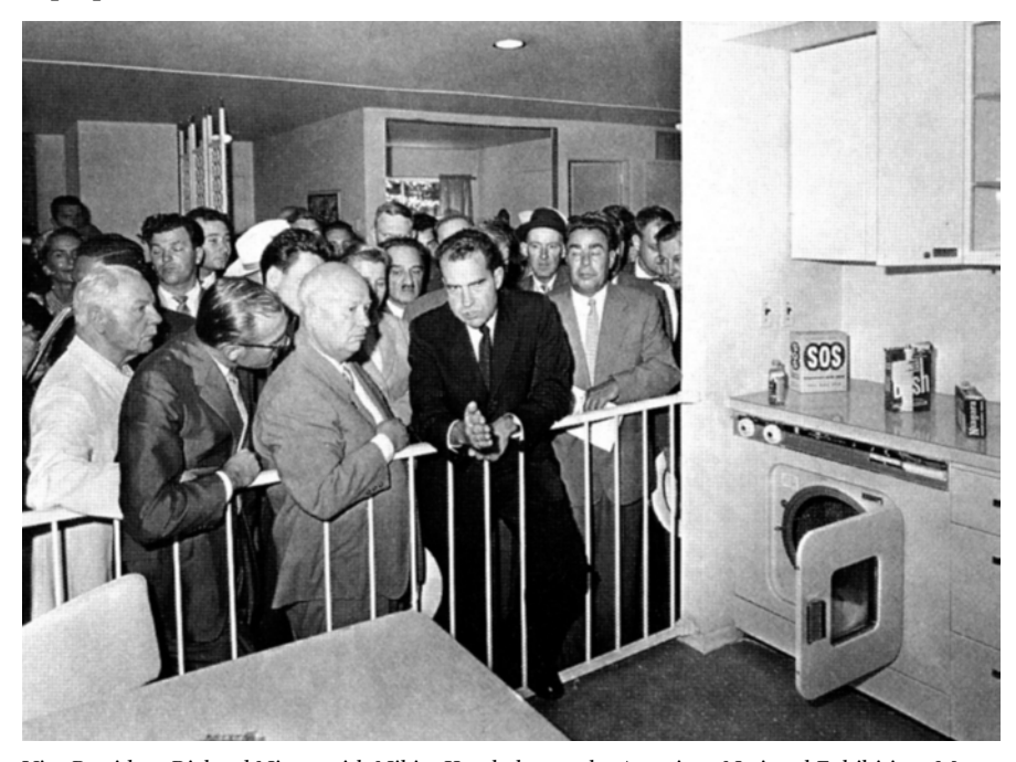
Vice President Richard Nixon with Nikita Krushchev at the American National Exhibition, Moscow, 1959. The exhibition vividly illustrated the ideal image of American mass consumption and domesticity for the Soviet public.

and a helmet called 'Personal Instrument', an art object by Krzysztof Wodiczko (1969), which filtered out, blocked or spied on all sounds, symbolizing both the surveillance of the Secret Police and the voicelessness of the people under communism, completed this human feeling of helplessness in the face of the superpowers at work.