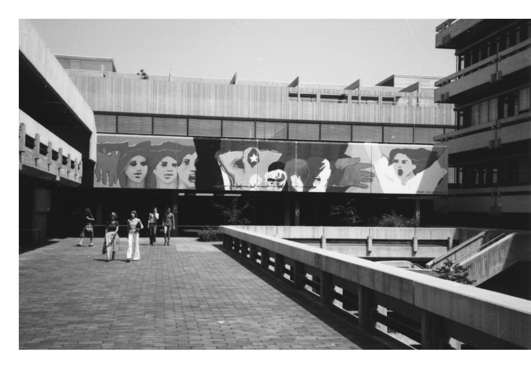
A colorful, huge and highly symbolic mural at the University of Bremen, painted in 1976 by the Brigada Luis Corvalán with the assistance of West German art students. This mural, originally one of three parts, measures 3 by 21 meters. Having suffered weather damage after some decades, it was reconstructed on a smaller scale in 2014.

(University Archive Bremen, 7/B-Nr. 69/4, 1976 or later)