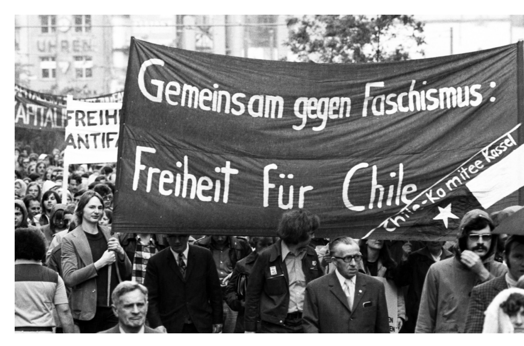
Together against Fascism: Freedom for Chile. Demonstration of more than 40,000 people from Germany, Italy, Chile, Greece, Spain, and other countries, Frankfurt am Main, 10 May 1975 – thirty years after the end of World War II and the 'fascist' Hitler regime.

by 1978, the question of armed resistance in Chile became academic.<sup>39</sup> These divisions not only enervated the solidarity movement, but also coincided with a retrenched attitude amongst government officials towards left-wing appeals of solidarity and specifically towards political refugees from Latin America.<sup>40</sup> If Chancellor Brandt's antifascist past had allowed activists to pressure him, his successor Helmut Schmidt's legacy as an officer in the Wehrmacht (former German Army) left little recourse on that front.<sup>41</sup>