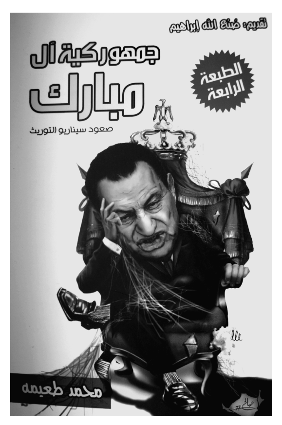
Cover-page of Gumhurkiyya Al Mubarak, by Muhammad Ta'yma, published by Mayrit, Cairo 2010

Only very shortly before the revolution, on the cover page of the satirical treaty against Mubarak Junior's succession to the Egyptian throne, an aggressive caricature seemed to open up Pandora's Box of previously restrained Egyptian anger. It was entitled The Re-Kingdom of the Mubarak Family – Presentation of an Inheritance Scenario , and the introduction was written by the famous novelist Sun'allah Ibrahim. Mubarak, with a horribly deformed face, is sitting on the damaged throne of the Egyptian Republic-Kingdom. The projected stagnation of this hybrid regime is highlighted by the spider webs that cover even the immobile autocrat himself.