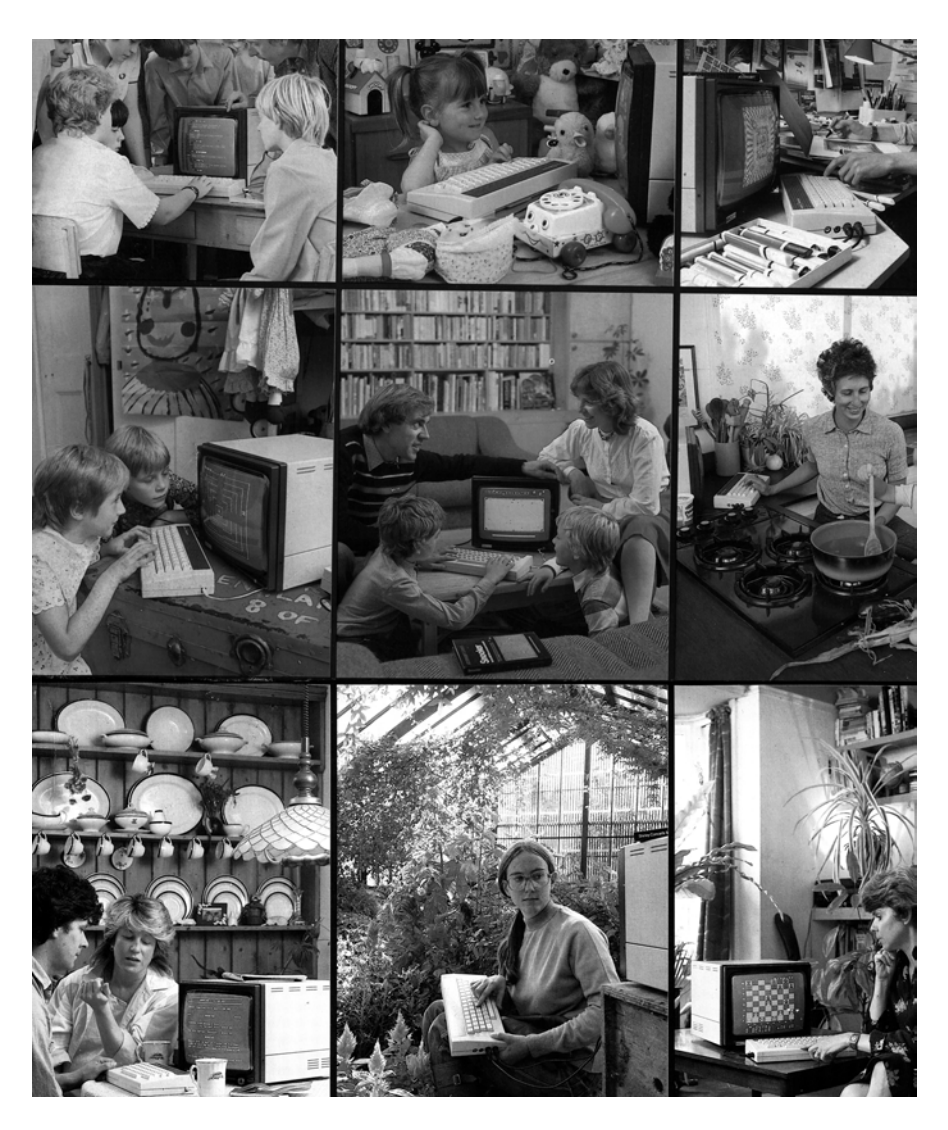
This matrix of images appeared on the retail packaging box for the Acorn Electron, an attempt by the BBC Micro's manufacturer to enter the lower cost market defined in the UK by Sinclair and Commodore. Where the BBC Micro's marketing had focused on education, the Electron was presented as more of an all-purpose machine for home use. Variations on the 'domestic setting' theme are multiplied to an extreme level.