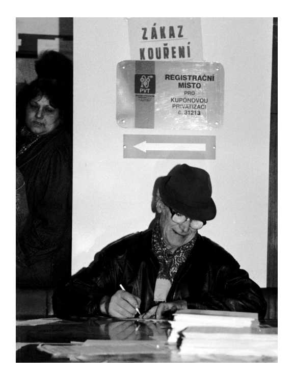
Becoming capitalist subjects: Czech pensioners sign up for the voucher privatization at Prague's registration spots, 1992

As prescribed by the romantic plot, if everyone on the side of the good does his or her job, they eventually defy the odds, cure the patient and succeed: The market economy [...] is a natural condition of mankind, and it should be possible to return to such a natural state [...]. At the beginning there may be only a few [entrepreneurs], but they will be heroes, the new pioneers who will breach the dam separating us from the natural state of affairs and take others along with them [...]. c^{62} This was the vision presented to the Czechoslovak public by the most read Czech daily on the eve of the launch of the economic reform, bringing together the romantic plot of liberal economics — with its praise of the figure of the entrepreneur so typical of the Austrian school — with the notion of a return to proven historical standards, which were at the same time seen to be natural and timeless, i.e. transhistorical.