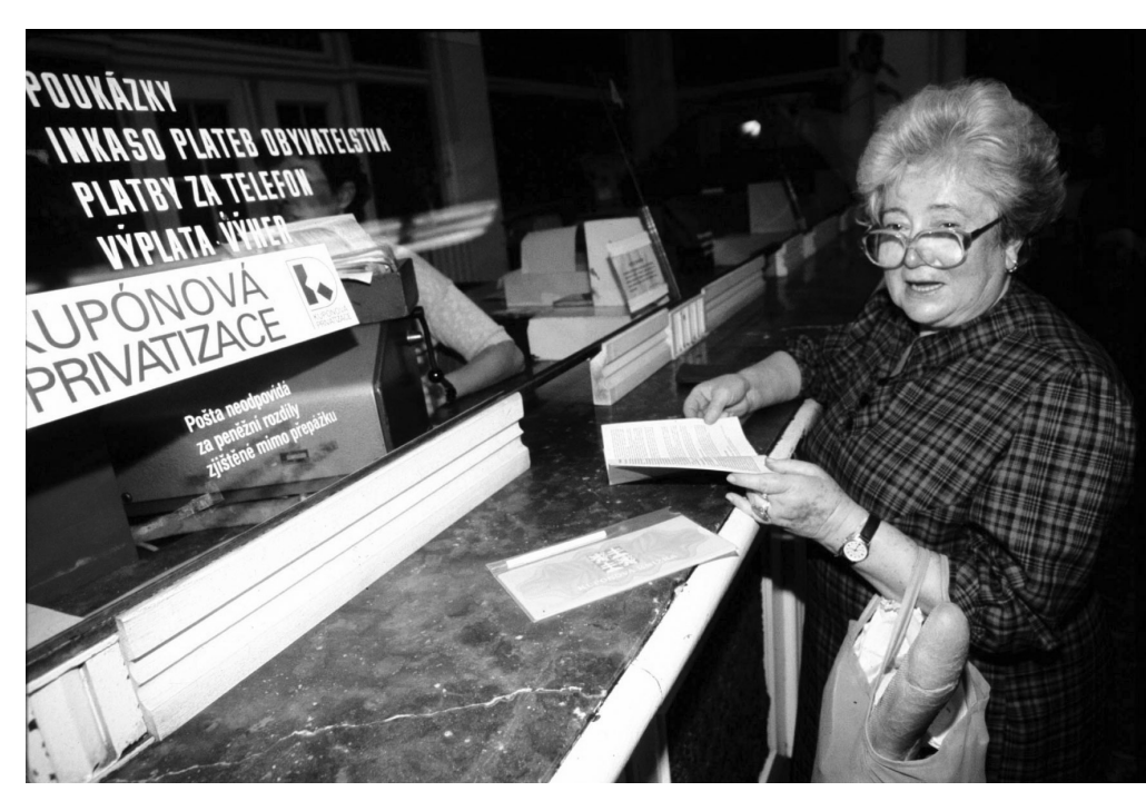
Voucher privatization at Prague's registration spots, 1991