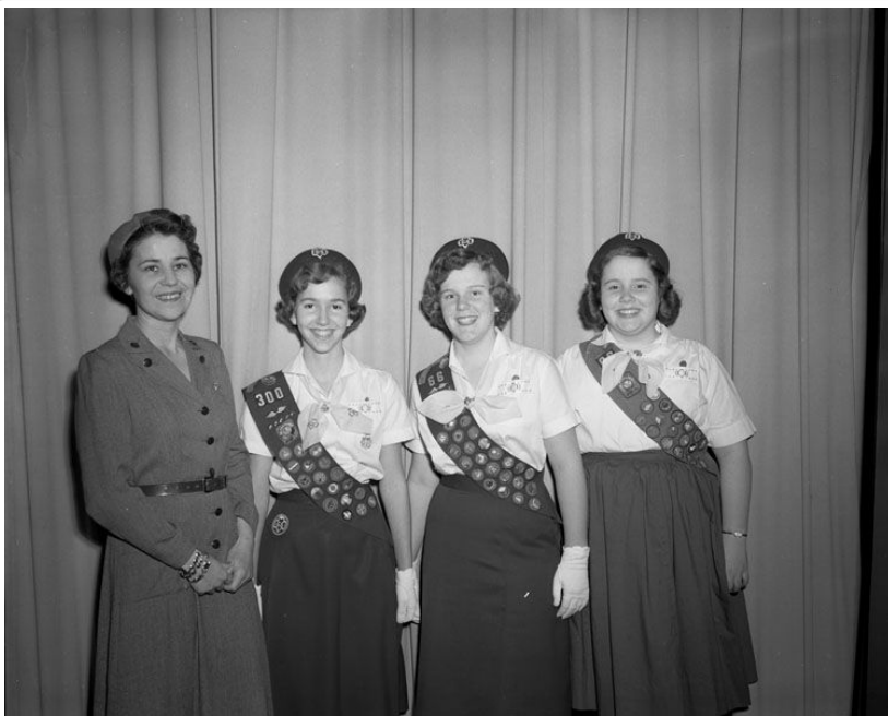
Girl Scouts, April 1958.

called into question. The ideals of discipline, camaraderie and self-sacrifice prevailing in organizations that toed the party line remained as male-coded as ever. The charged relationship between conservative and progressive gender roles is just as pronounced in the female equivalents of these youth organizations in the Anglo-Saxon world: the Girl Scouts in the United States and the Girl Guides in the British Empire. The Girl Scouts, founded in 1912 by Juliette Gordon Low (1860-1927), sought to distinguish themselves from the somewhat older Campfire Girls, which Low rejected as too traditionalist in their understanding of what girls should aspire to. Low created the alternative concept of a community of experience for girls and women in which patriotism, athletics and conservatism were melded with classic female virtues like housekeeping and child-rearing. This ambivalence was both politically intentional and strategically necessary, since the uniformed Girl Scouts were initially perceived as a provocation by their male colleagues. [50]