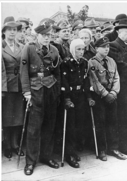
Members of the Hitler Youth at a demonstration, autumn 1943, Photographer: unknown. Source: Bundesarchiv Bild 183-J08403 (ADN) / Wikimedia Commons, license: CC BY-SA 3.0

practice. [15] The challenge begins with the sources. In general, those used to reconstruct the worlds inhabited by children and young people are much harder to track down than records pertaining to the programmatic aims and objectives of organizers or the practices of individual educators and caregivers. The relative voicelessness of young people in the archives has led some historians of childhood to see parallels between their subjects and other marginalized groups and hence to utilize postcolonialist approaches in their attempts to lend these underage protagonists voice. [16]