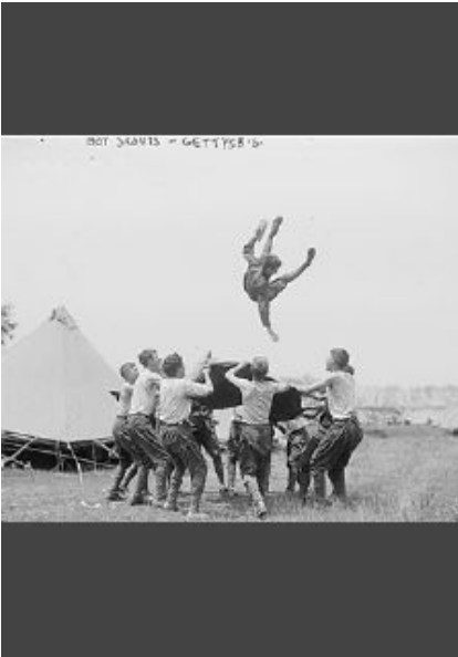
Boy Scouts, Gettysburg, July 1913.