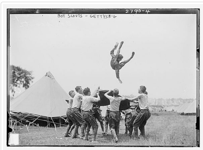
Boy Scouts, Gettysburg, July 1913.

movements of fascist and communist provenience – a specific angle primarily indebted to my own research interests in the history of youth and childhood in the transatlantic region. I will address other organizational forms in passing, including the party-affiliated youth groups of the Federal Republic of Germany. I will also discuss some path-breaking deliberations from the historical study of totalitarianism as well as important work on civic education and the extracurricular socialization of young people. Finally I will consider some approaches from gender and global history which have set new accents in the field since the turn of the century. But first we will need to define more precisely the key concepts of “youth” and “youth organizations” with recourse to the relevant literature.