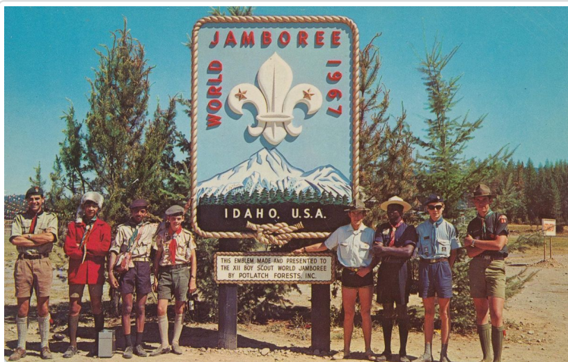
XII Boy Scout World Jamboree - Farragut State Park, Idaho, August 1967.