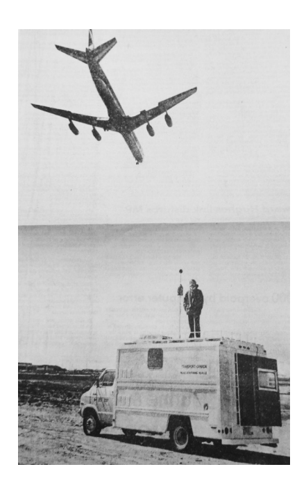
Acoustical Engineering employee measures aircraft noise on top of mobile >Noise Measurement Vehicle</br> near Vancouver International Airport, 1973.

equipment that was housed in mobile units at each of the sites to compile the data, which was then sent to the National Research Council of Canada for analysis. <sup>45</sup> The units contained recording and radio communication systems connected to two microphones as well as a wind direction and velocity indicator positioned outside. <sup>46</sup> The results of these tests were not what the government had hoped for; preliminary results showed high and potentially hazardous readings in Richmond underneath or adjacent to aircraft departures and landings. <sup>47</sup>