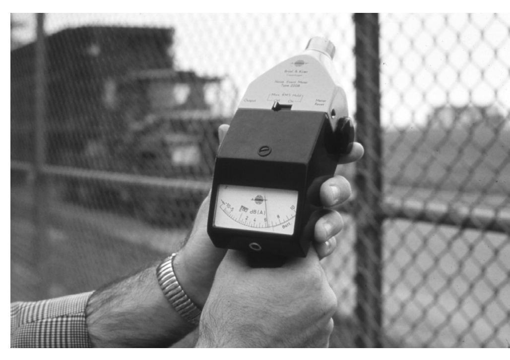
Noise research and noise reduction programs have become important since the 1960s not only in Canada, but also in the United States. The noise meter shown in the photo, taken at Boston Logan International Airport in June 1973, recorded over 86 decibels.

visits to houses on sale near Toronto on days when planes were not using the nearest runway and lobbying federal authorities to pressure pilots to minimize noise during take-offs and landings. ^{25}