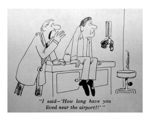
Jet-age noise and its effects – a recurring cartoon theme

Local noise complaints also focused on perceived flaws in the government's noise mitigation strategy, particularly its reliance on the NEF system. In a 1974 position paper, the Greater Vancouver Regional District (GVRD) blasted the NEF's schematics, calling it a 'faulty< methodology